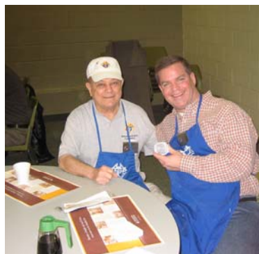
Working Together! More photos on page 2...